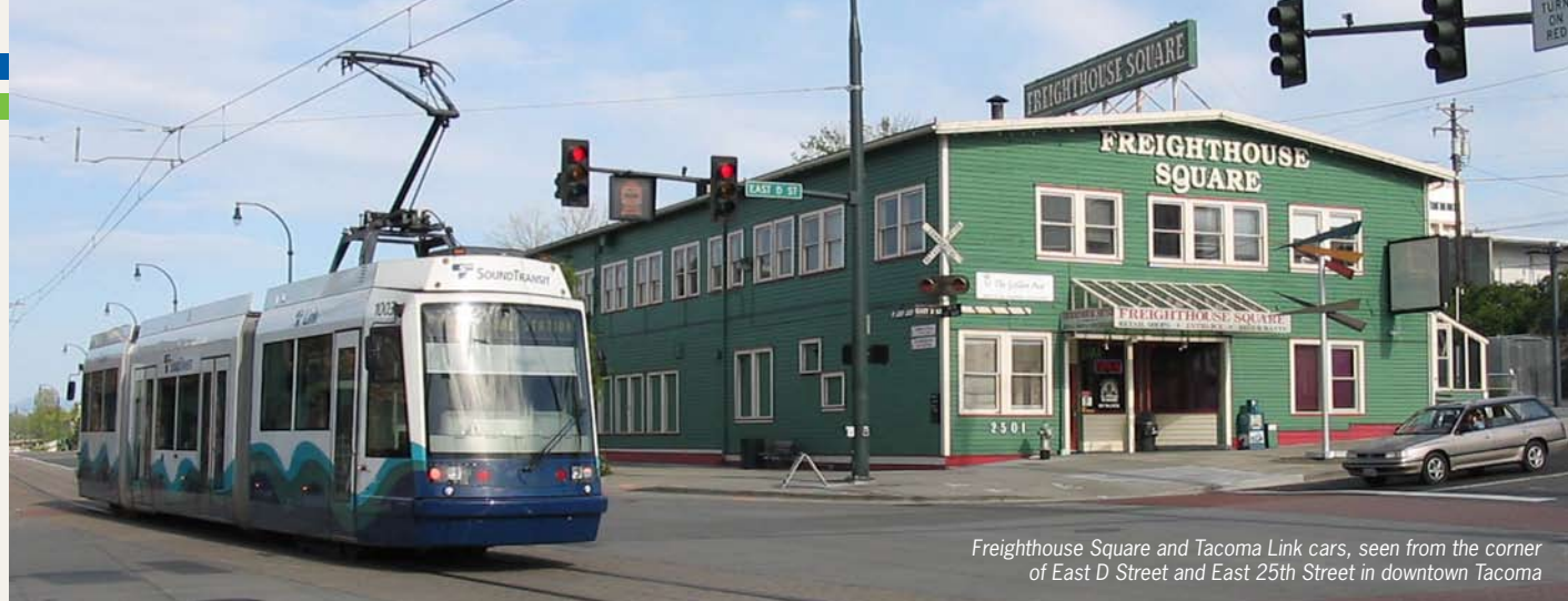
Freighthouse Square and Tacoma Link cars, seen from the corner of East D Street and East 25th Street in downtown Tacoma