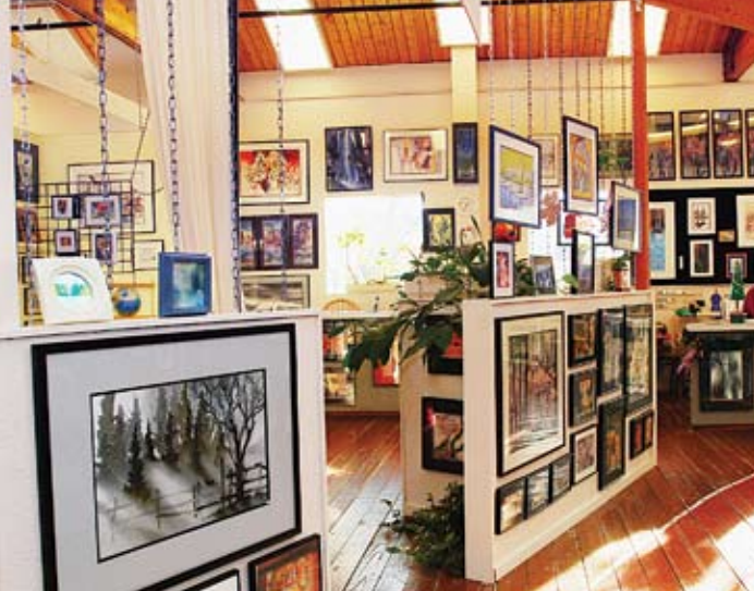
Art gallery at the Freighthouse Square